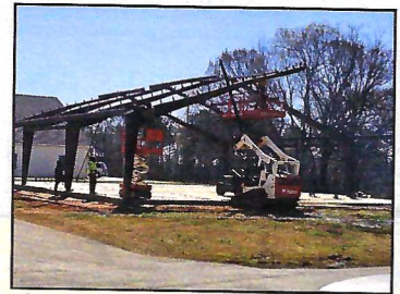
Check out the Pavilion Project at www.mwbm.org .

We want to thank you for the Christmas cards and gifts that were sent to us this past year. It is such an encouragement to us.