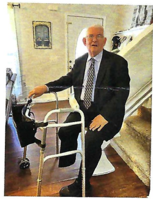
On the way to church 10-13-24. I'll be using the new leg soon. --->