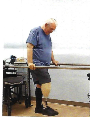
<--- Being fitted with a new leg, 9-11-24.