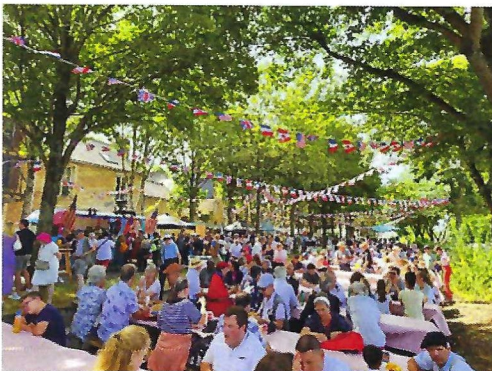
80th-anniversary celebration in Lemans