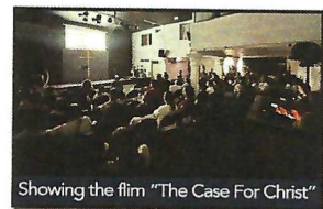
Showing the film "The Case For Christ"