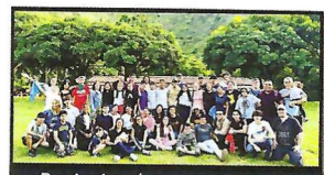
Pouring into the next generation of youth for the glory of God.