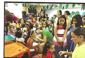
What a blessing to serve kids from the community on Children's Day!

I'm genuinely amazed at how Jesus continually builds his church. We constantly witness new spiritual births as people believe the Gospel, and we see them grow and work together in Jesus' mission. Week by week, people are bringing their friends to Jesus. We've been busy with special events, too. We recently celebrated Children's Day, serving over 100 kids from the community and sharing lots of fun and the Gospel. We showed a Gospel film; many people brought lost friends and family. God is working, and what a blessing to be a part of it!