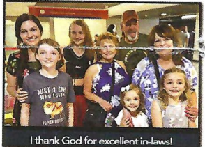
I thank God for excellent in-laws!