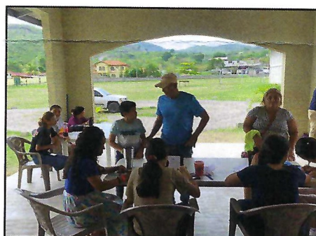
This is where they were registered and taken to their respective waiting areas.