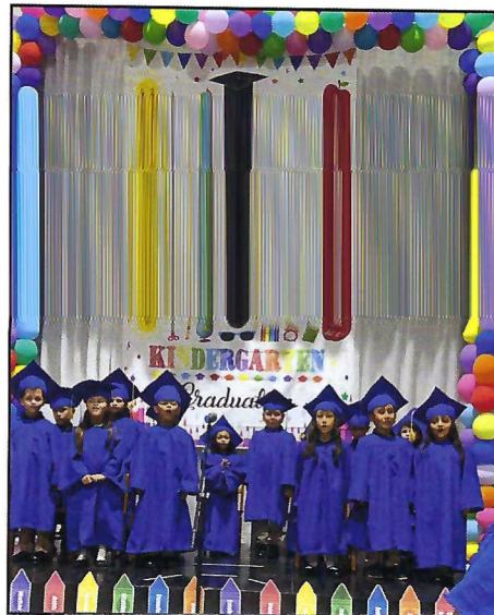
Our 2024 Kindergarten graduating class. I can't wait to see those cute faces again in August!