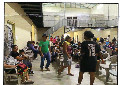
A view from the back of the church. As you can see the place was packed. The people waited patiently and were so extremely grateful for the help.