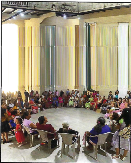
Mother's Day 2024 - The mothers were seated in a circle after church and received a gift and a cupcake.

Please enjoy just a few images of the wonderful things that took place during May and June. All of this is made possible by your prayers and support. I wish you could each experience it first hand, because it is truly amazing.