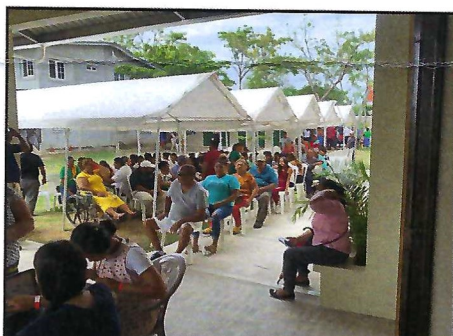
Tents set up to wait before registering to see the doctor. Many other people were waiting outside the gate to get in. People were lining up before 6 AM each morning to have the chance for the help that was so desperately