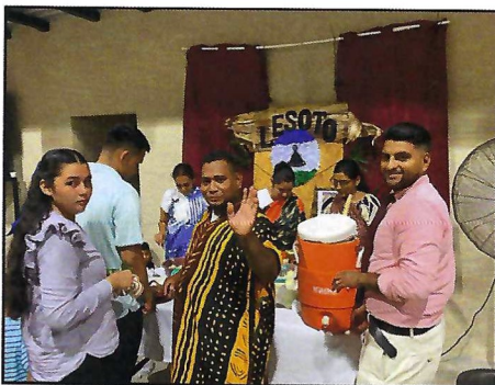
International Experience 2024 - just 3 of the countries represented. I am still amazed at all they did. We have some very talented people here in the church!